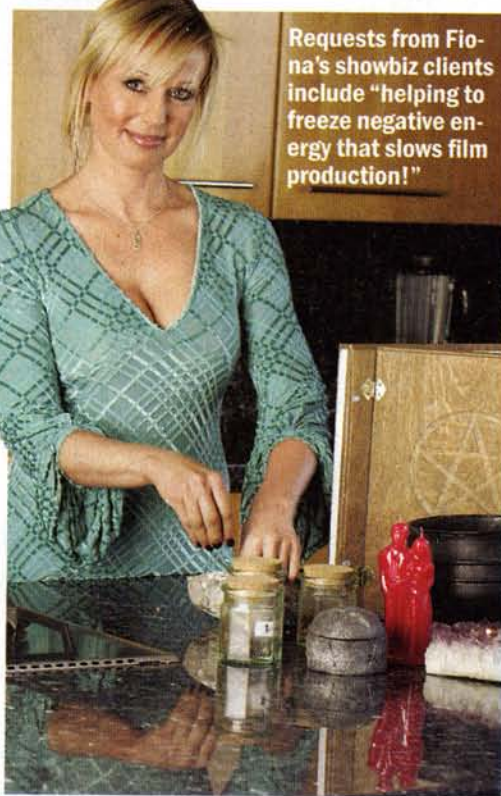
Requests from Fiona's showbiz clients include "helping to freeze negative energy that slows film production!"