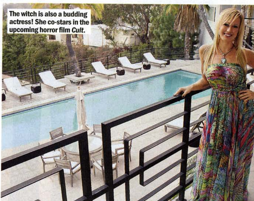
The witch is also a budding actress! She co-stars in the upcoming horror film Cult .